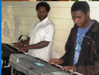
Music Ministry National Baptist Union Women's Conference, 2013