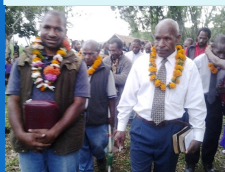
Intertribal Crusade Guest Speakers, 2nd to 4th March 2015.