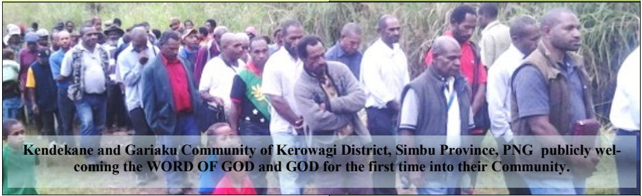
Kendekane and Gariaku Community of Kerowagi District, Simbu Province, PNG publicly welcoming the WORD OF GOD and GOD for the first time into their Community.

It has been the prayer and cry of many believers to see change in the lives of people of Kendekane-Gariaku inter-tribal community. Members of this community started introducing the producing of local alcohol (spirit or steam or home brew) and consumption since 1990. They were known for growing, supplying and taking Marijuana for over many years. The devil had a foothold in the community and the lives of the people for many years.