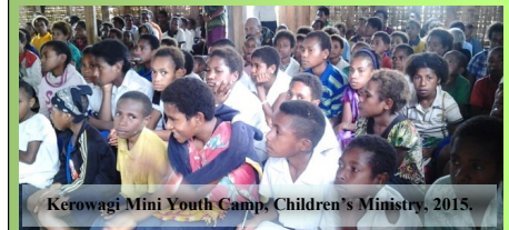
Kerowagi Mini Youth Camp, Children's Ministry, 2015.

There were over total of 300 youths and children gathering to celebrate the risen Lord and Saviour Jesus Christ. The chil-