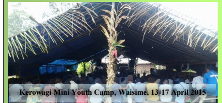
Kerowagi Mini Youth Camp, Waisime, 13-17 April 2015

There were over total of 300 youths and children gathering to celebrate the risen Lord and Saviour Jesus Christ. The chil-