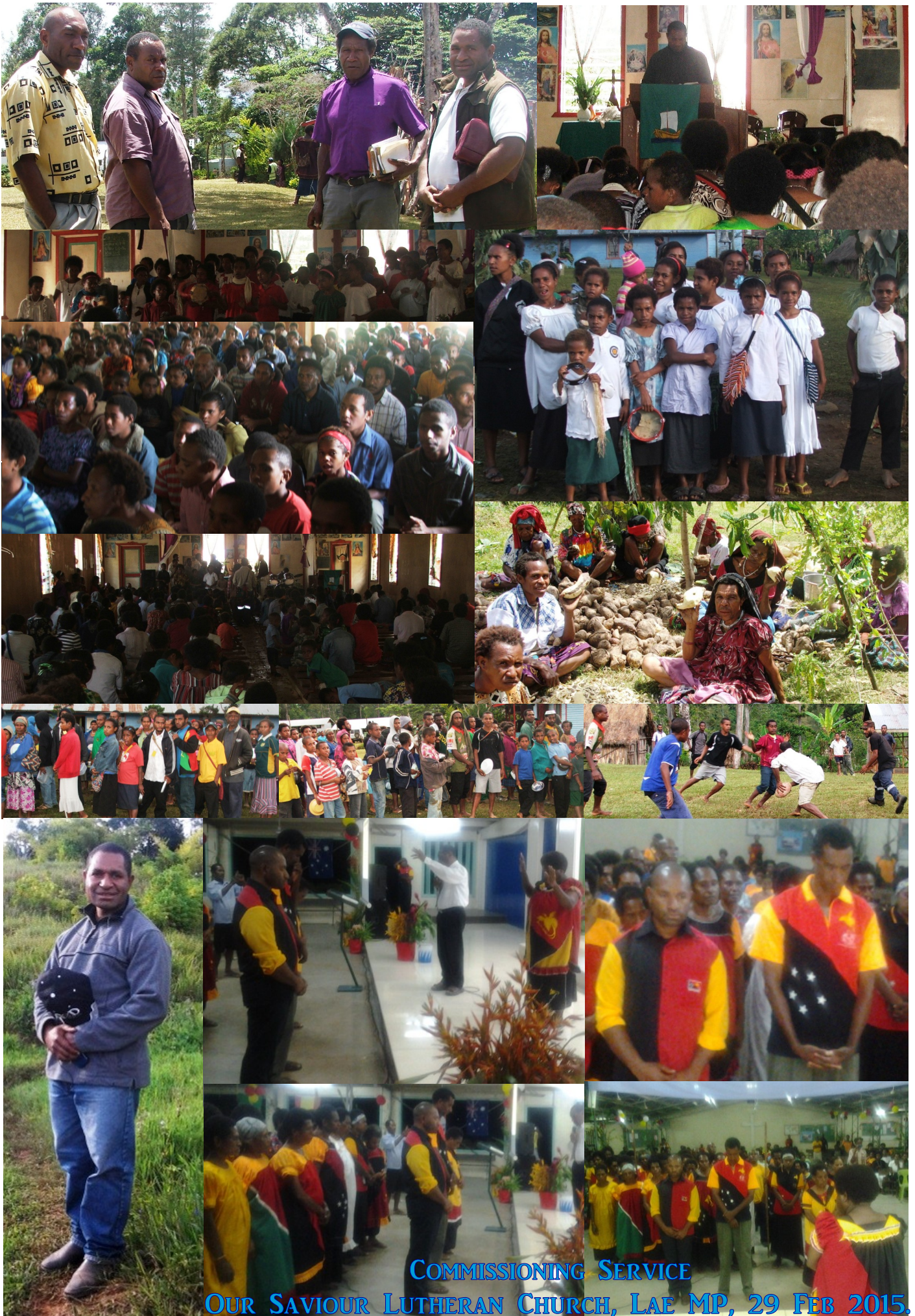
COMMISSIONING SERVICE OUR SAVIOUR LUTHERAN CHURCH, LAE MP, 29 FEB 2015.