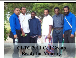
CLTC 2011 Cell Group Ready for Ministry