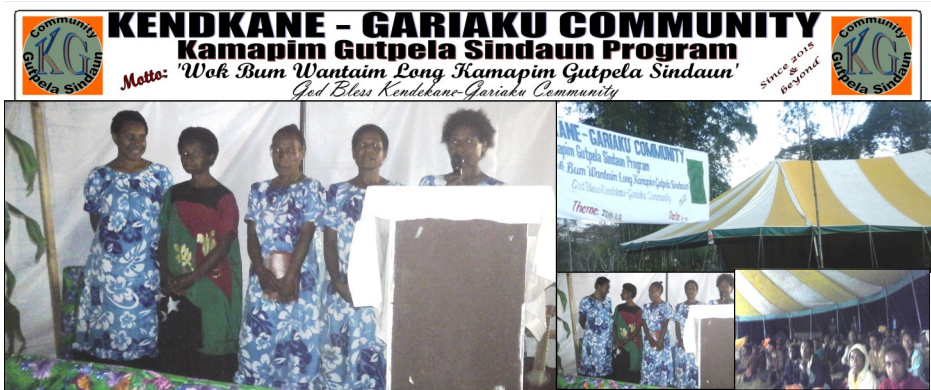
KendeKane and Gariaku Community of Kerowagi District, Simbu Province, PNG Second Kamapim Gutpela Sindaun Crusade, 14-18 Sept 2015.

As the chairman of this community initiative, on behalf of KGCKGS member churches and community members and leaders, I kindly thank you for your prayer and financial support following my first news letter, which made the second community crusade a success.