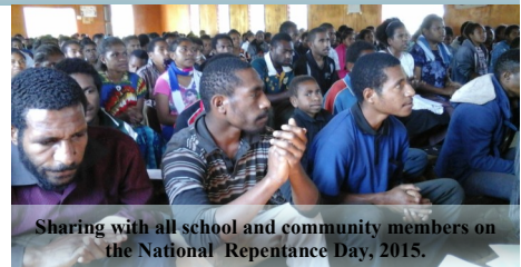
Sharing with all school and community members on the National Repentance Day, 2015.

schooling day, few minutes were always set aside before and after lessons to learn from God's Word focusing on the theme "Discovering God's Purpose for Your Life" (Pro 19:21) and having a time of prayer for individual needs.