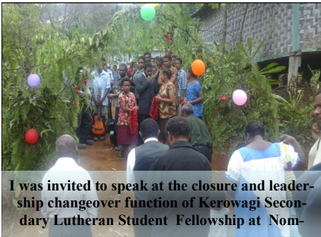
I was invited to speak at the closure and leadership changeover function of Kerowagi Secondary Lutheran Student Fellowship at Nom-

Its always my joy to share and encourage young people from God's Word to pursue success in their future.