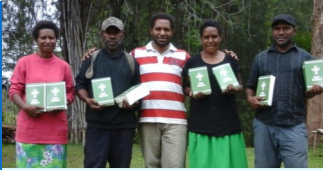
Distribution of Bibles to various local Churches in Kerowagi District.

And surely I am with you always, to the very end of the age.