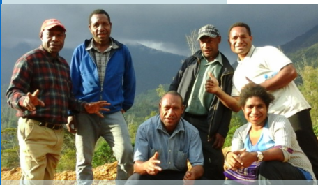
Kewamugl Lutheran H/S teachers (above) and students assembling (below).

It has been my joy to experience classroom environment with teenagers and young adults who are