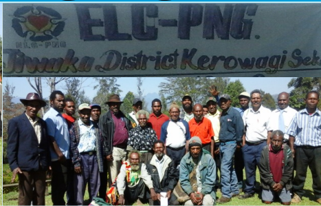
ELCPNG Kerowagi Circuit Conference, Kewamugl Parish, Jiwaka.